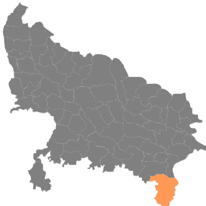
Annexure-1: Location map of Sonbhadra district within State